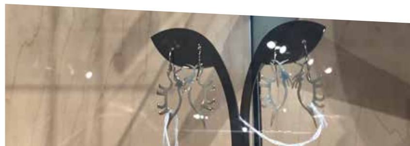
Unique Dino-Jewelry available in the Kaleidosaur Gift Shop NOW!