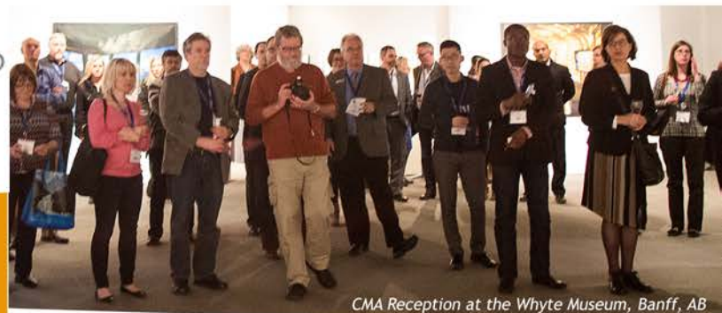
CMA Reception at the Whyte Museum, Banff, AB