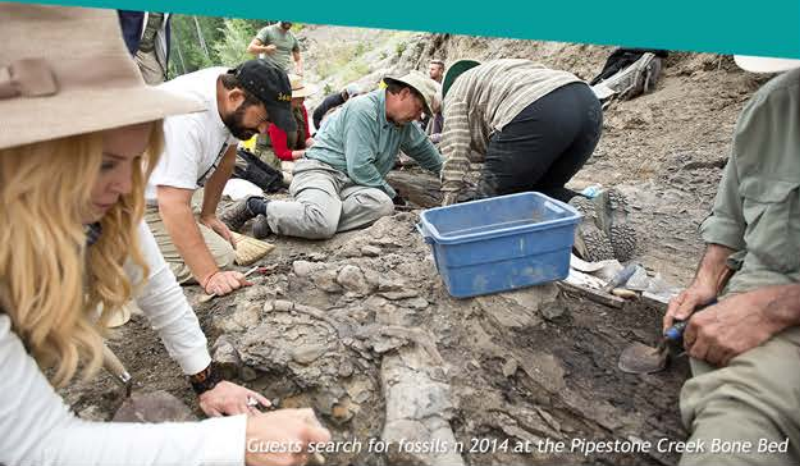
Guests search for fossils in 2014 at the Pipestone Creek Bone Bed